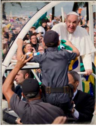
(Pope Francis blesses the son of a policeman from the Popemobile as he arrives to celebrate Mass on Copacabana Beach, Rio de Janeiro, Brazil, during World Youth Day, July 28, 2013.)